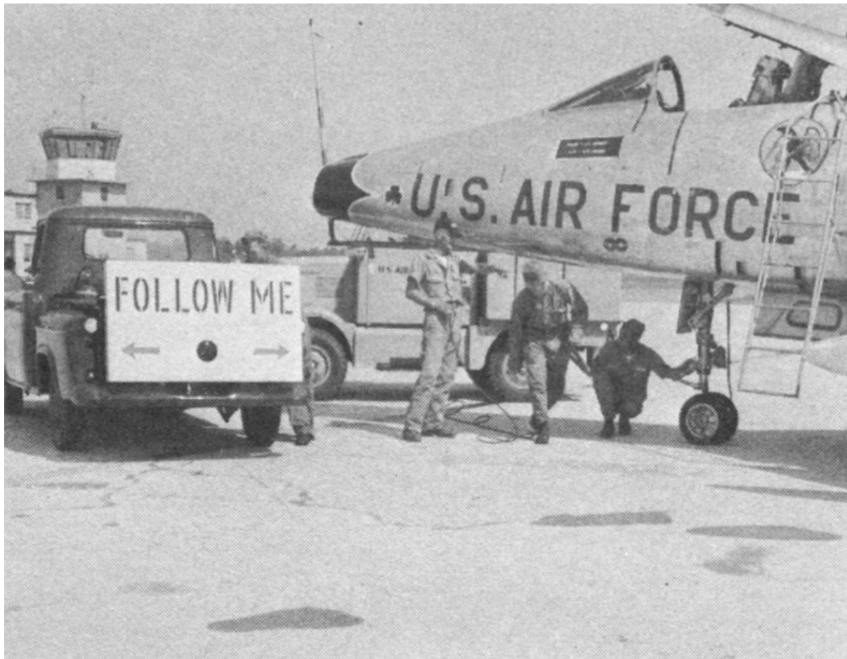
354 th Field Maintenance Squadron personnel service an F-100.