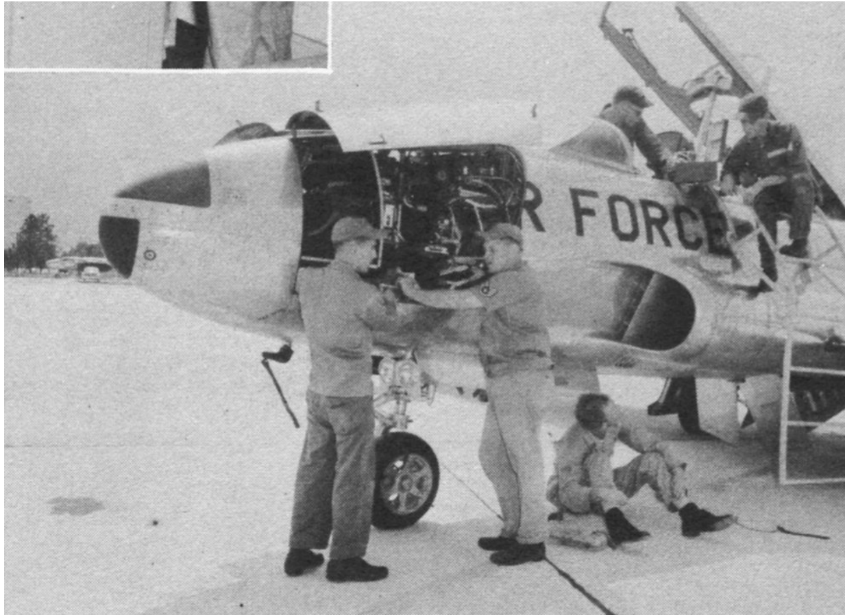
354 th Field Maintenance Squadron personnel service a T-33.