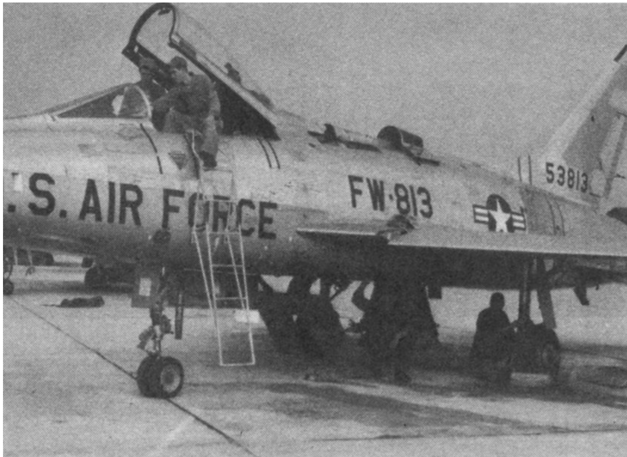
354 th Field Maintenance Squadron personnel service an F-100 at Myrtle Beach AFB.